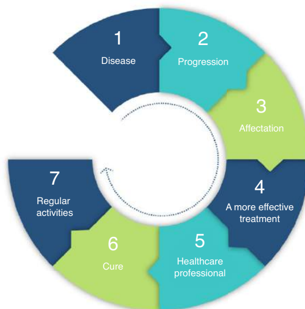
Fig. 2 – Flexible lines.

empirical treatments, which makes it difficult to carry out an event or affectation that can change the flow of these hard lines to flexible or escape lines. 21,22