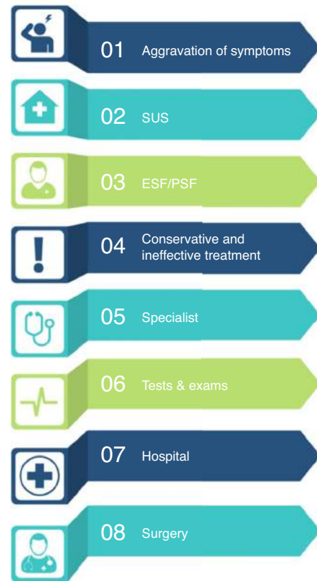
Fig. 4 – Trajectory of patients submitted to hemorrhoidectomy.

“I was lucky because it seems that some person was quitting the procedure; thus, they sent me over, in the place of that person.” (E9)