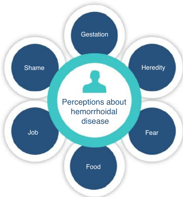
Fig. 3 – Perception of the patient about hemorrhoidal disease.

a limiting cause for achieving a plan of immanence, freeing patients from disease and decreasing its potency. 19,20