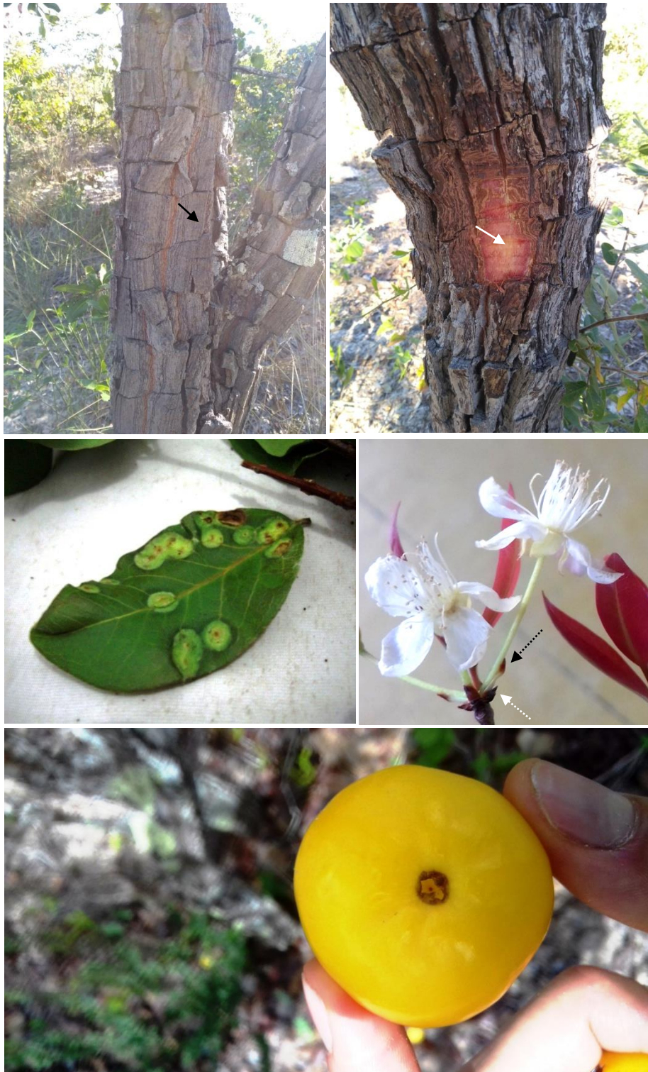
FIGURA 2. Eugenia dysenterica . A. Ritidoma, crista da fissura plana (seta preta). B. Alburno (seta branca). C. Lâmina foliar com galhas elipsoides. D. Catafilos (seta pontilhada branca) e brácteas (seta pontilhada preta). E. Fruto maduro.