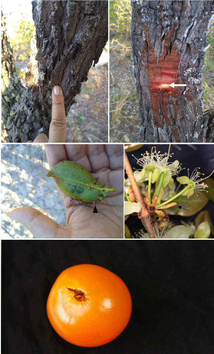
FIGURA 1. Eugenia moda . A. Ritidoma (em destaque, crista da fissura aguda). B. Alburno (seta branca). C. Lâmina foliar com galhas oblongas (meia seta preta). D. Catafilo (seta preta) e bráctea (seta pontilhada preta). E. Fruto maduro.